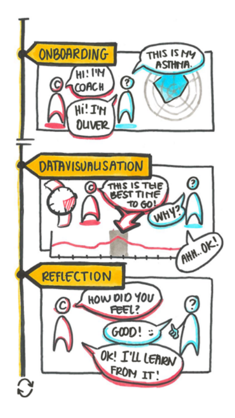
Figure 1. Overview of Coach

intake where triggers are translated into a personal index, a personal advice can be shown for any moment in the upcoming two days.