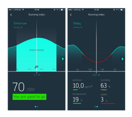
Figure 3. Screenshot of the second layer of data

information we wanted to communicate. The first level is a simple cue on whether or not it is advisable to go for a run based on environmental data. Second, there is the more personal and explanatory level at which the user could see a personal index, as can be seen in figure 3. This index exists of the current state of environmental data combined with the personal trigger-score, which was filled in by the user during the intake. While, within a bad moment, three out of four variables are within healthy range, Coach still advises not to run on account of the user's pollen allergy. The last and most detailed level consists of accumulated information on the different variables, showing the progress of the different variables over time. This could be useful in the process of creating more awareness (and providing more insight into data).